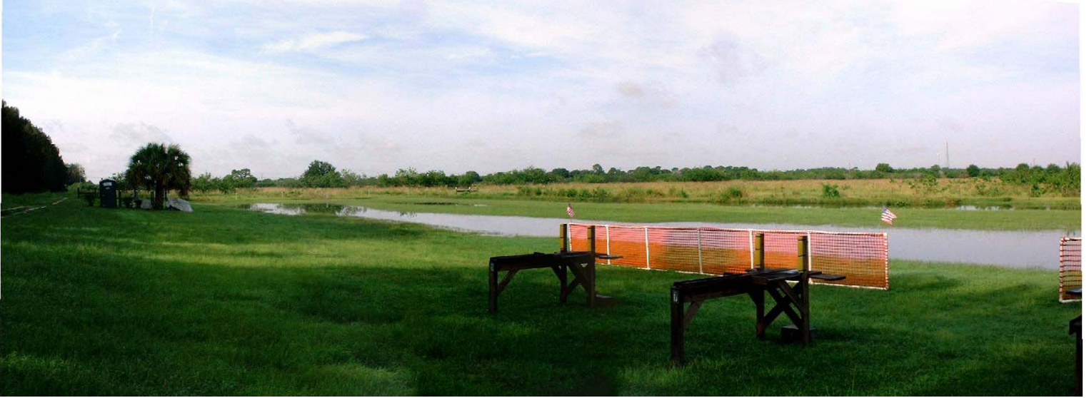
Indrio field following recent rains– Planes being fitted with pontoons