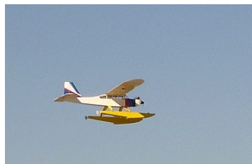
Strat's Tree Skimming Seaplane