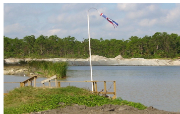
Our new Windsock