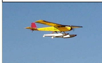
Bill's "Old Faithful"